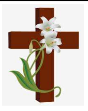
Sunday School—9:30am Worship Service—10:30am