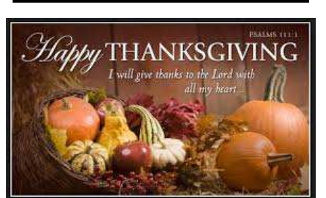
FBCC Office will be closed Thursday and Friday November 26 and 27 In observance of Thanksgiving

We have continued to order church literature for you. On Sundays you can pick up the Mature Living, Home Life, Stand Firm and Open Windows from the tables near each entrance to the sanctuary. During the week they are available at the church office entrance.