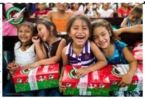
Just look at these happy faces

Samaritan's Purse Shoeboxes--on my goodness. It's almost time to ship them off, so would you please bring the boxes to the church by Nov. 10th. I hope you have been packing lots of boxes and that they will be a blessing to the children that receive them. Watching some of the videos you can see how excited the children are and to think they also receive the Gospel message. The message is even more of a blessing. Thank you for each box you pack. You are going as a missionary to a part of the world where you may never go in person, but you go by way of a shoebox. May you continue to be richly blessed in your mission works.