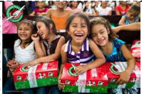
Just look at these happy faces

Church Family, Samaritan's Purse Shoeboxes--on my goodness. It's almost time to ship them off, so would you please bring the boxes to the church by Nov. 10th . I hope you have been packing lots of boxes and that they will be a blessing to the children that receive them. Watching some of the videos you can see how excited the children are and to think they also receive the Gospel message. The message is even more of a blessing. Thank you for each box you pack. You are going as a missionary to a part of the world where you may never go in person, but you go by way of a shoebox. May you continue to be richly blessed in your mission works.